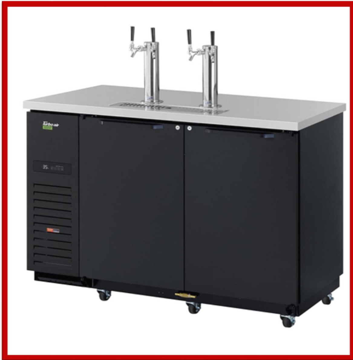
Black Two Half Barrel Cpw soda Dispenser